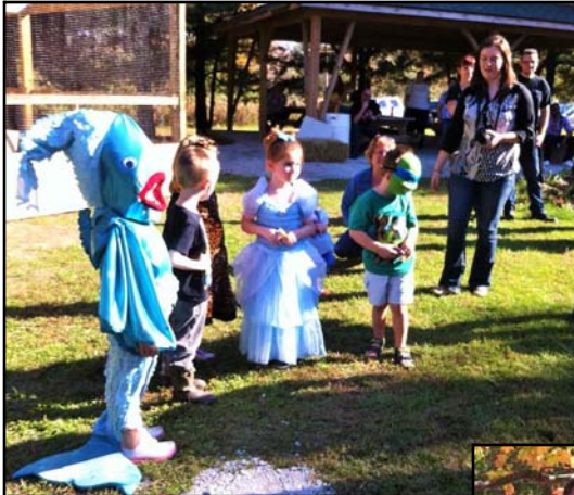
Halloween costume contest