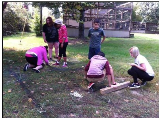
Granite City High School Science Club laying the groundwork for a new cage on their monthly workday at TreeHouse