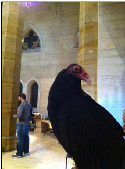
Einstein at Blessing of the Animals Christ Church Cathedral, St. Louis