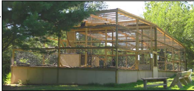
Bald Eagle—Turkey Vulture Cage

Our cages are expensive to build, but after many years of building cages and checking out cages at different wildlife rehab centers around the country, we've come up with a design that seems to cover all the bases.