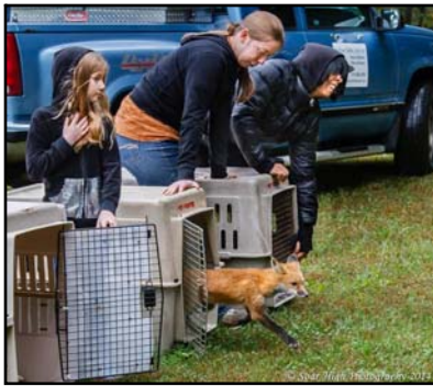
Ready, Set, GO!

Once they were ready, we released the foxes in groups in different remote locations where they had plenty of forests to call home. Nine of them are running free now. We are still holding onto four kits that needed a little more time at our center before returning to the wilderness when conditions are optimal. We did move them to a different outdoor enclosure however so that Chuckles and Zorro could have their home to themselves again. It definitely has been a crazy year for foxes! Will things be back to typical numbers next year? We will see.