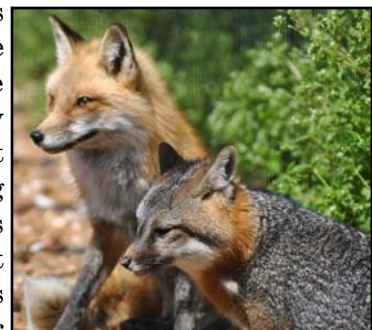
Chuckles and Zorro

The foxes slowly weaned from fox formula to canned food and then from canned food to hard dog food. Once they were completely on hard food it was time for them to move outside to our large fox enclosure where we keep Chuckles the Red Fox and Zorro the Gray Fox. However, things are never that easy. Seemingly out of nowhere we had mange pop up in the group of three. Mange is a common and highly contagious problem with foxes. It is caused by a mite that imbeds itself in the skin and causes intense itching, crusting on the skin, and hair loss. We started treating all of our kits immediately even though it was only found in one group at the time. Unfortunately, we ended up losing one of the kits from the group of three, despite our best efforts. The other kits however made a full recovery and we did not see any symptoms among the other groups.