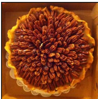
A cake walk prize — Yummy Salted Caramel Pecan Pie from LuciAnna's Pasteries, Alton