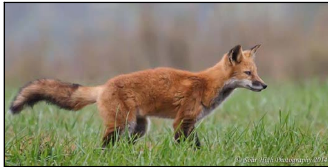
Free at last!